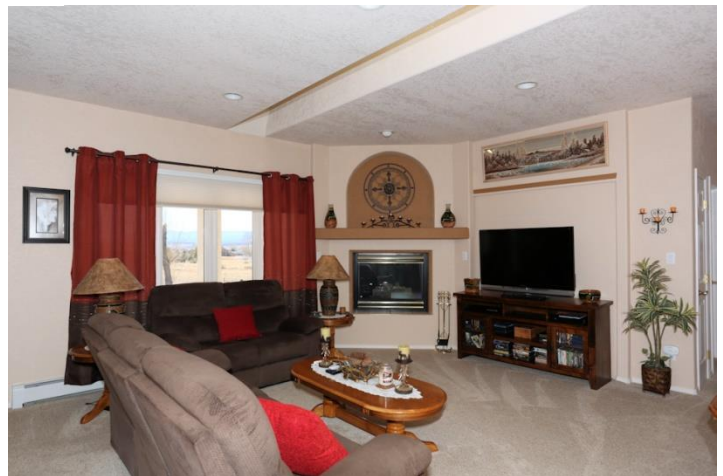
Living Room Has Mountain View. Gas Fireplace. New Carpeting.