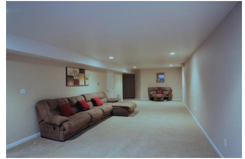
Huge, Warm, Inviting Family Room. Plenty of Space for Big Screen TV Plus Pool Table or Other Game Tables.