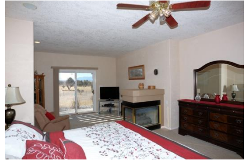
Spacious Master Bedroom. Great Mountain View. 3-Way Gas Fireplace. Walk-out.