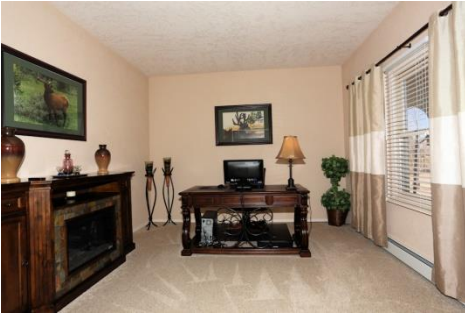
This Room near Front Door. Can Be an Office, Living Room, or Formal Dining Room.