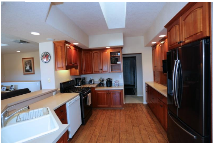
Cherry Kitchen Cabinets. New Stove, Refrigerator, & Microwave.