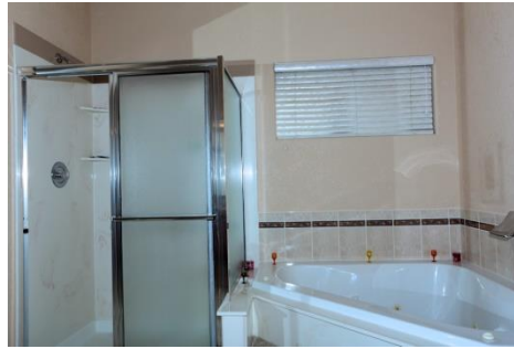
Jetted Tub. Window for Great Natural Light. Glass Enclosure for Stand-alone Shower.