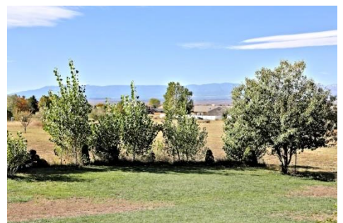
Outstanding Mountain View from Back Patio. Incredible Sunsets.