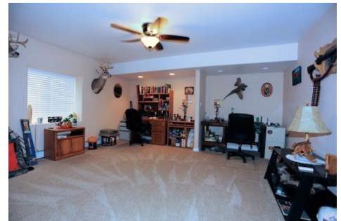
This Bedroom Is One of Two Exceptionally Large Bedrooms in the Basement.