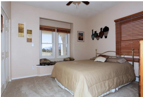
One of the 5 Bedrooms. This One Has a Great Mountain View. Would Make a Great Office.