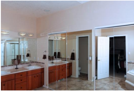
5-Piece Master Bath. Wall of Mirrored Doors to Huge Walk-in Closet.