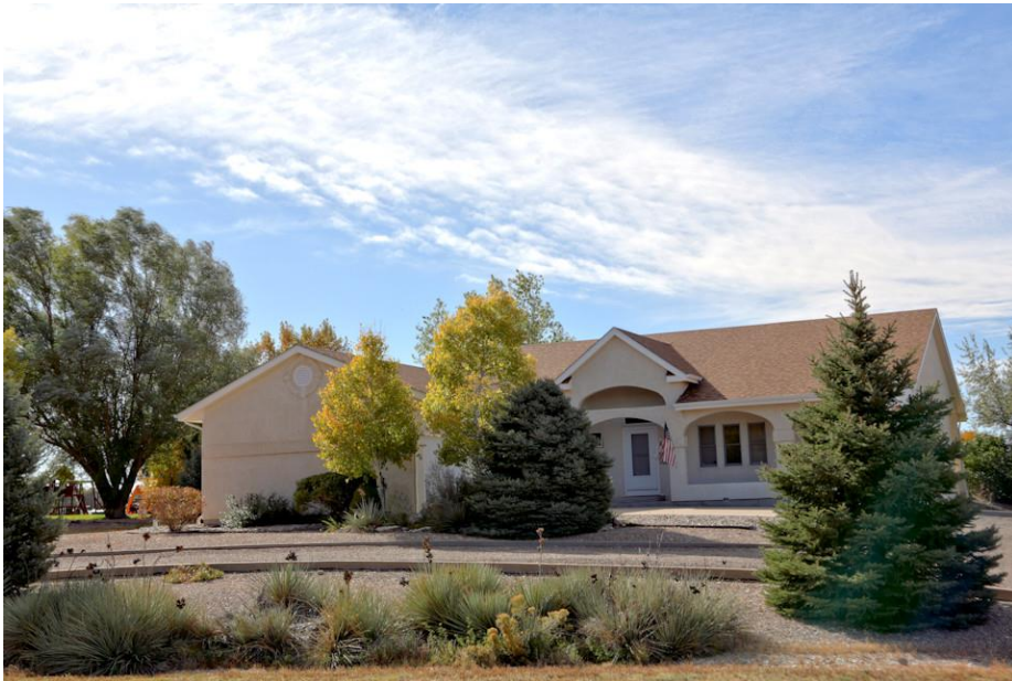
Nicely Landscaped. Attractive Front Elevation, Circular Driveway.