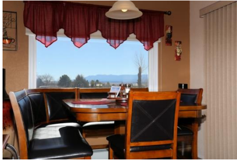
Fabulous Mountain View from the Dining Area. Walk-out to Back Patio.