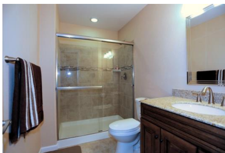
Downstairs Bathroom Is a Spacious 3/4 Bath.