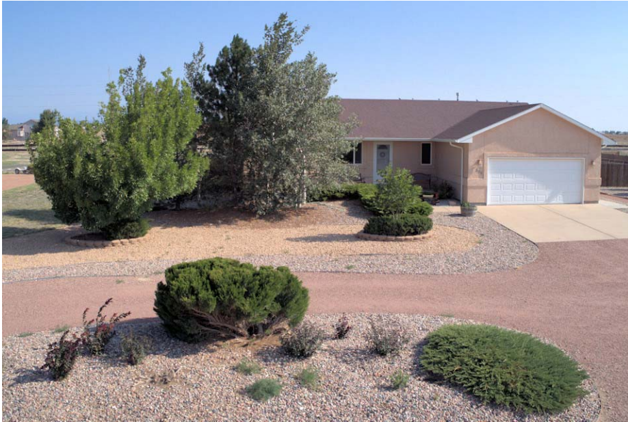
Circle Driveway with Concrete Pad. 2-Car Attached Garage