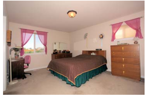
Master Bedroom Is Spacious. Has View of Back Yard.