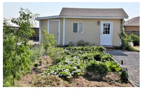
Side by Side Sheds. Garden Area for Flowers and Vegetables. Above Ground Irrigation.