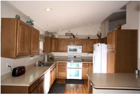
Kitchen Has Wood Floor. All Major Kitchen Appliances Included. Breakfast Bar.