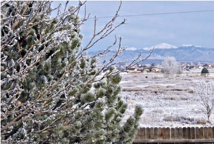
View of Pikes Peak from Back. There Is Also a Mountain View from the Front.