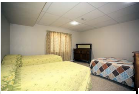
Bedroom #4 Is Extra Large. It Has No Closet But There Is Plenty of Space for a Big Wardrobe.