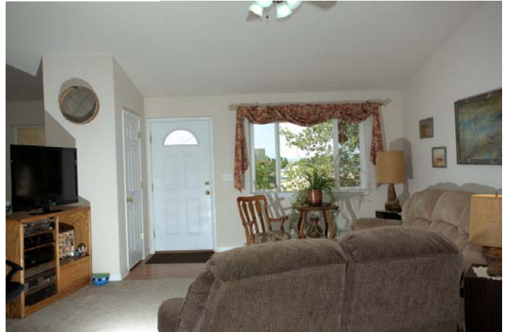
Comfortable Formal Living Room.