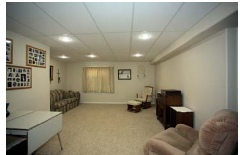
Extra Spacious Family Room in Basement. Room for Big Screen TV Plus Game Table.