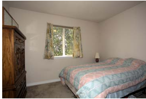
Bedroom #2 Is on Main Floor. Modern Split Bedroom Design with Master on Other End.