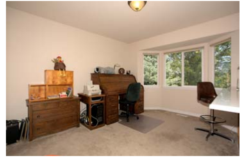
Bedroom #3 Is on Main Floor. Has Bay Windows with Great View of the Mature Trees.