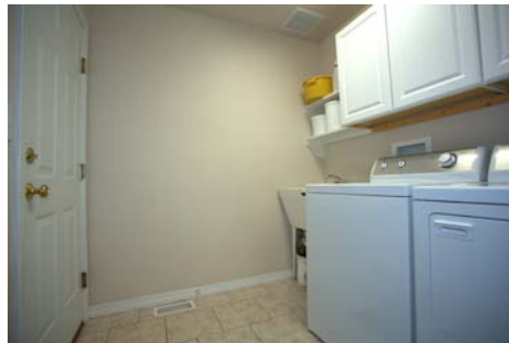
Laundry Room Is on Main Floor near Master Bedroom. Has Laundry Sink. Door Leads to Garage So the Room Doubles As a Mud Room.