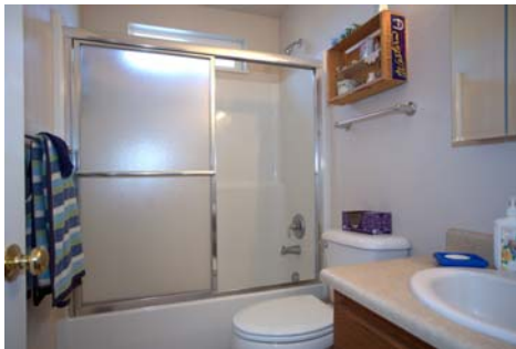
Bathroom #2 Is on Main Floor near Bedrooms 2 & 3. It is a Full Bath.