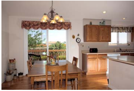
Dining Area Has Glass Patio Door for Natural Light. Great View of the Trees in the Back Yard.