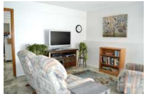
Huge Basement Family Room Has Walk-out and Great View of Greenhorn Mountain. Plenty of Room off Camera for a Pool Table.