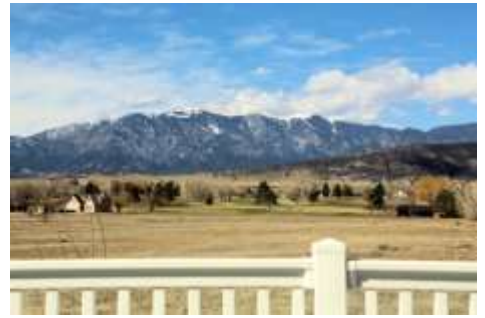
View of Greenhorn Mountain from Deck. Golf Course View.