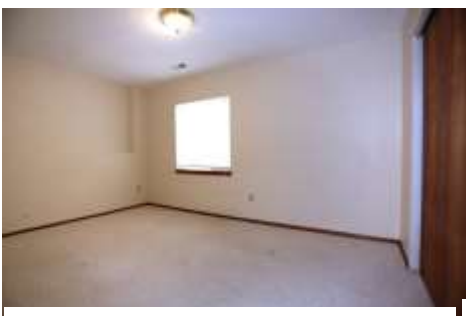
Bedroom #4 Is in the Basement. There Are Also Two Big Storage Rooms in the Basement.