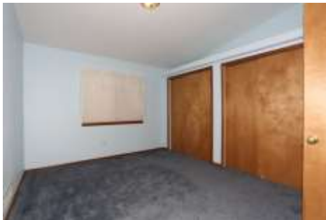
Bedroom #2 Is on Main Floor. Has Two Closets. Carpeted Floor.