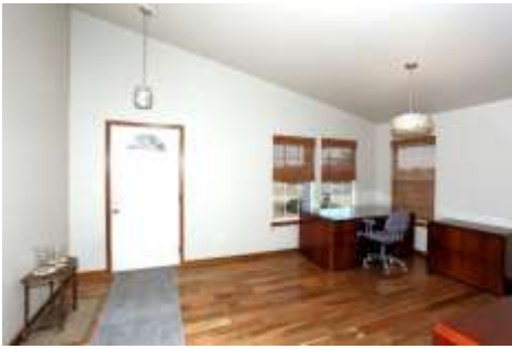
Office or Dining Room near the Front Entry. New Acacia Wood Flooring for Most of Main Floor.