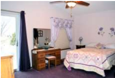
Master Bedroom Has Walk-Out to Back Deck. Great View of Greenhorn. Carpeted Floor.