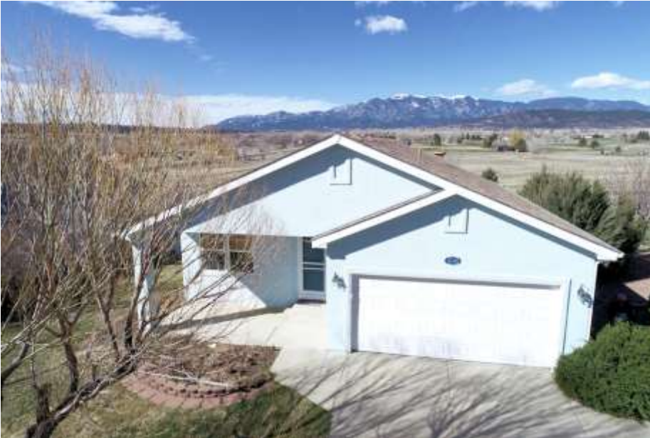
2-Car Attached Garage. View of 12,000' Greenhorn Mountain. View of Golf Course in Background.