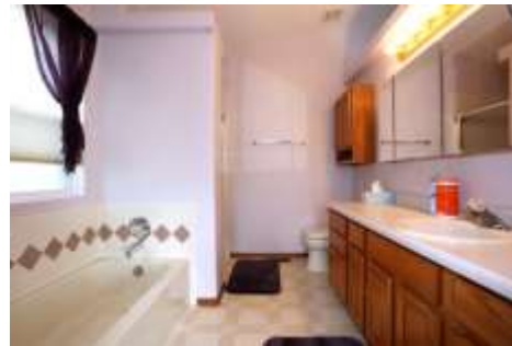
Master Bath Is a Full Bath. Walk-in Shower Has Glass Door. Vinyl Flooring.