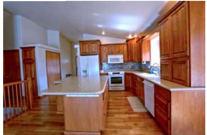
New Updated Beech Cabinets, Silestone Quartz Counters. Fridge, Stove, Dishwasher, Micro Included