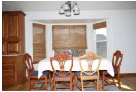
Dining Area Has Bay Windows. Almost Unlimited Space for Big Table & Chair Set.