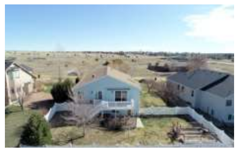
Fenced Back Yard, Sunsetter Motorized Retractable Awning. Raised Bed Garden.