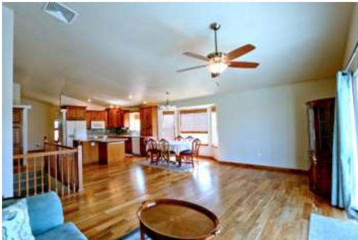
Living Room, Dining Area, & Kitchen Make Up Modern Open Floor Plan.