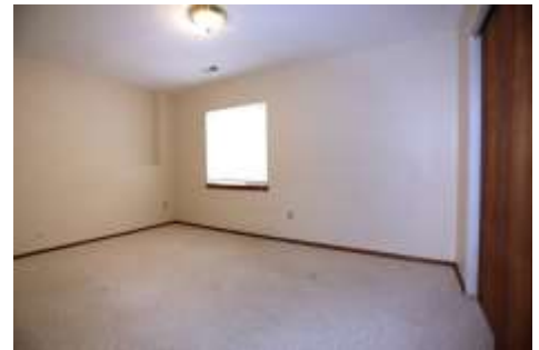
Bedroom #3 Is in the Basement. All Bedrooms Are Comfortably Sized.