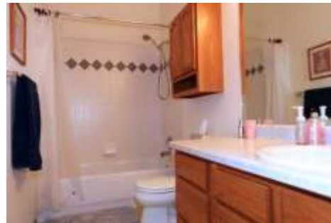
Bathroom #2 Is on Main Floor. Centrally Located and Convenient to Bedroom 2, Kitchen, Living Room, Dining Area, and Garage